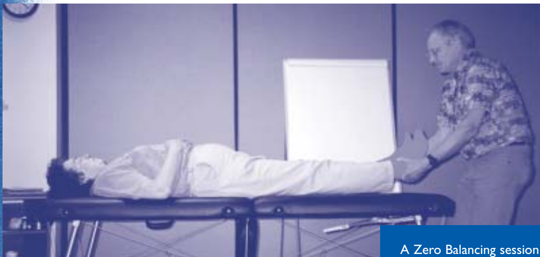
Smith gives a half-moon vector at the feet.

A Zero Balancing session usually lasts 20–40 minutes and is performed with the client fully clothed. The client will typically begin seated on a massage table during an initial evaluation and then lie supine for the remainder of the session. A minimum of three sessions is recommended as each session builds on the last. If needed, maintenance sessions are helpful every two to four weeks.